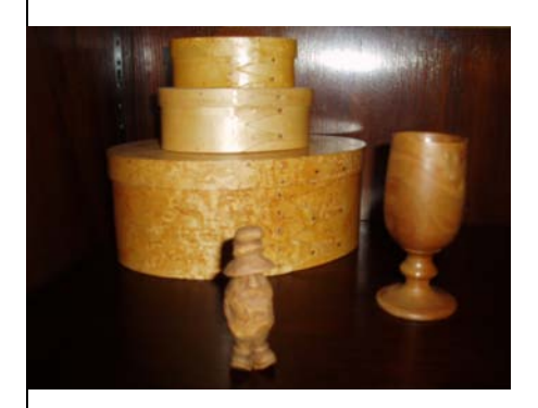
Shaker boxes, carved figure and turned vessel by AR