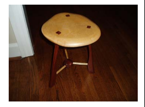
Unusual free-form stool by AR