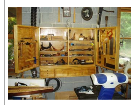
Tool cabinet made by AR