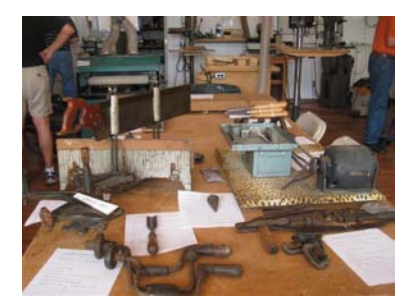
Some of the hand tools that were for sale.