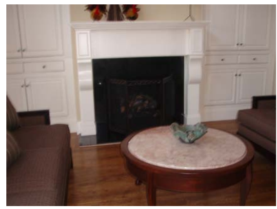
Fireplace surround and mahogany/marble coffee table By AR