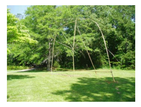
Bamboo trellis for gourds being grown at the Woodworking Education Center