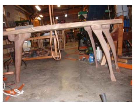
Sculptured walnut table by AR Bray